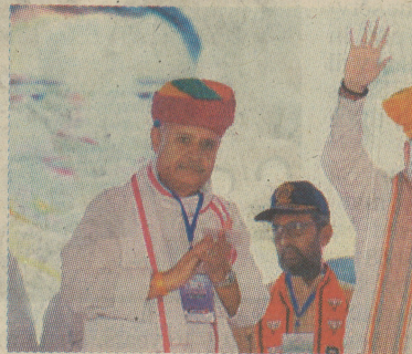
Union Minister Rao Inderjit Singh (left) at a poll rally in Haryana. South Haryana has been a stronghold since Rao's father Rao Birender Singh was ousted from power.